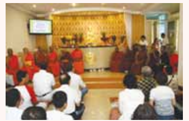
Venerables invited for the Qing Ming Service