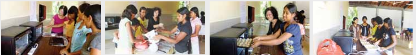
Cookie Baking Sessions