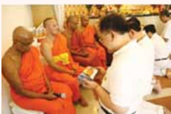
Offering of requisites to the Mahāsangha