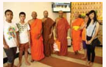
A photo with some the Bhantes