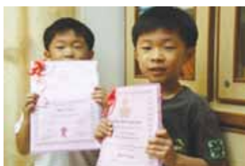
We have a certificate too!