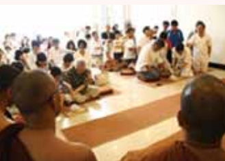
Transference of merits to all departed relatives & friends