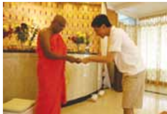
Students receiving their certificates from Bhantes