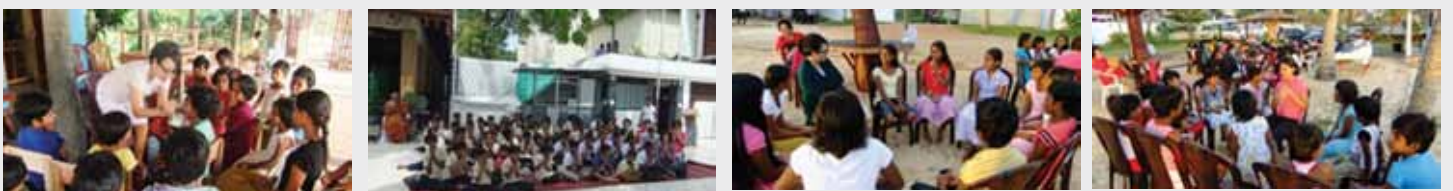
Interaction with the children