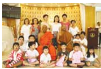
Some of the students with their teachers