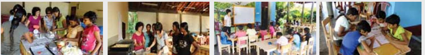
Let's try to bake a cake