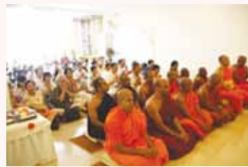
Buddha Pūjā at 11 am